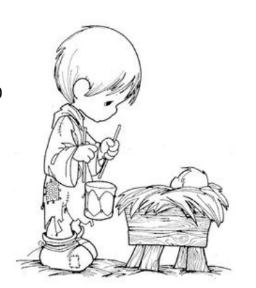
"Pa Rum Pa Pa Pum"