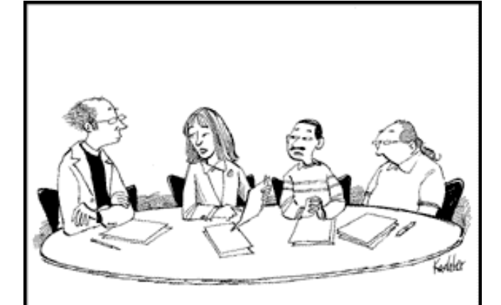
'Ages 45-64 fully support you, 65 and over are satisfied, the 18-30 group are mixed, and the 31 to 44 year olds say you've lost your mojo!"